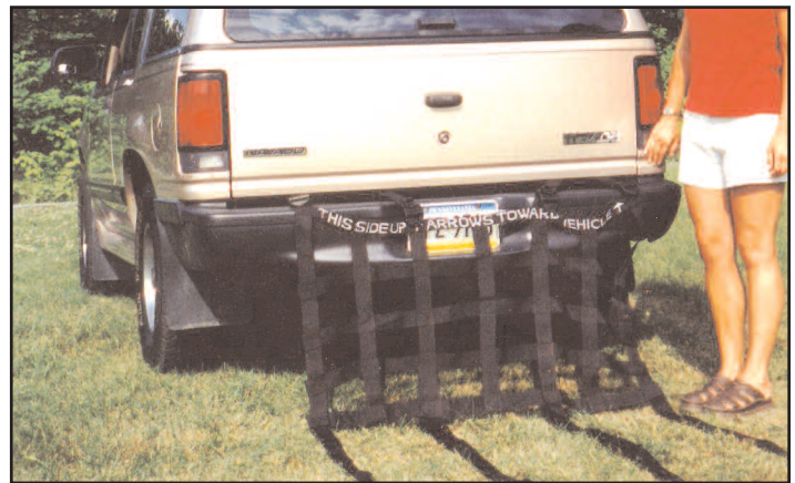
Close gate on web material

Pull Straps through cargo hooks of your SUV, then thread strap through belt buckle and adjust to bumper level