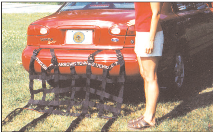
Close trunk on web material

Open fully putting each end strap around trunk hinge, thread strap through buckle and adjust to bumper level