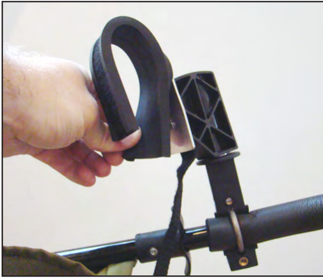
Step 1: Remove rubber cover on gun holders

Some early models of the Do-All Outdoors Gun Buggy were assembled with the gun holders facing down. While this can hold your long guns securely, it is not the optimal position. To turn the gun holders over, follow the simple steps below. If you have any questions, feel free to call Do-All Outdoors customer service line at 1-866-SHOT-DOC.