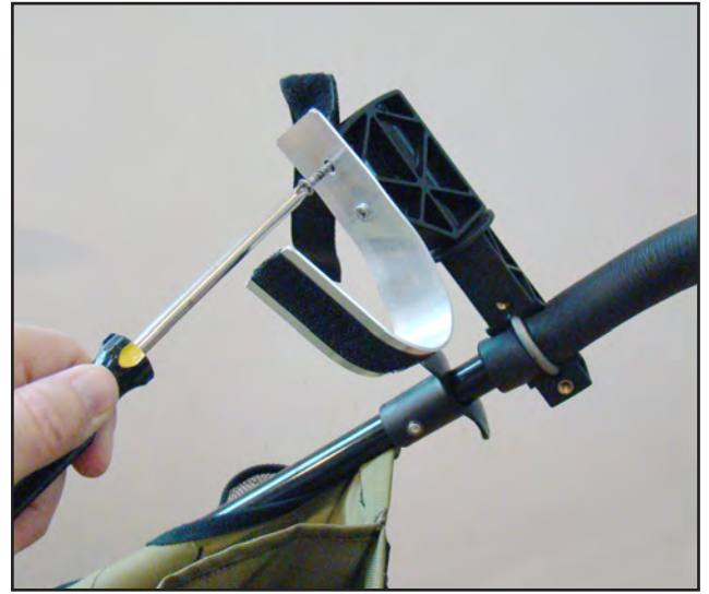
Step 3: Turn yoke over and re-attach screws