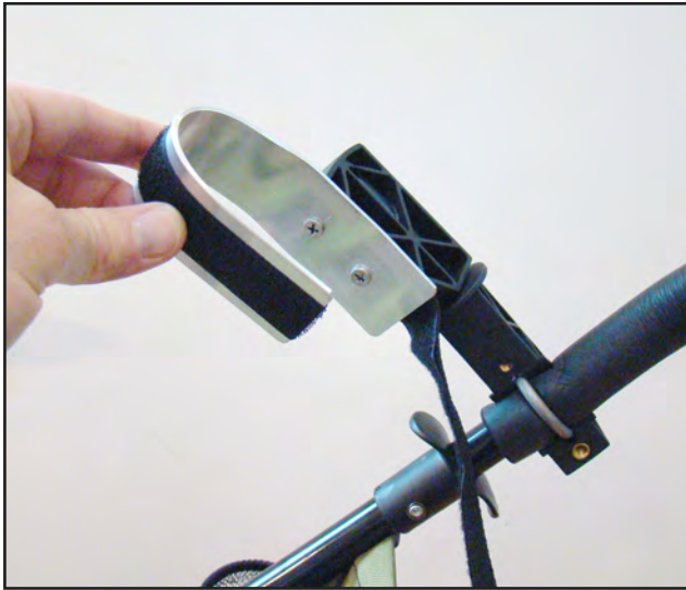
Step 2: Use a phillips screw driver to remove screws on yoke