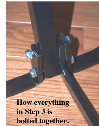
How everything in Step 3 is bolted together.

3. Take the 2 Curved Feet, the 1 Straight Foot, and the assemble Base Extension and bolt them together using the 2 provided Bolts and Nuts. The 2 Curved feet will go on the outside facing forward, curving out towards the shooter and make sure the Angle Bullet Deflection on the Base Extension is also pointing towards the shooter. The 1 Straight Foot will point and extend to the rear of the target offering stability. Now slip the bolts through all the pieces and tighten only when both are through and the 2 Nuts are hand tightened.