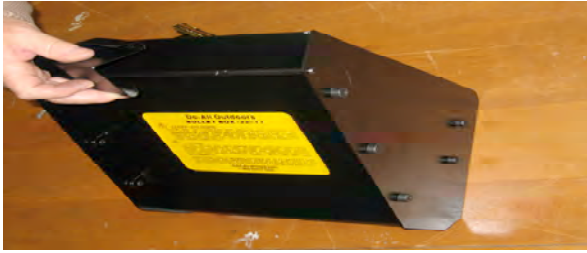
ATTACH TARGET BRACKET